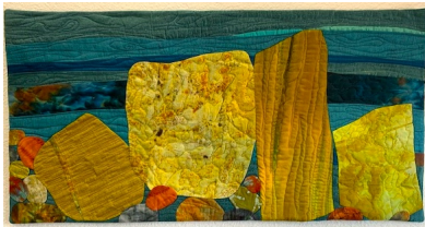
Stones Unturned by Jean Wells Keenan

Here are just a few of the pieces you will see when you visit the Stitchin' Post.