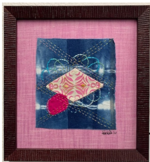
Pink Diamonds by Valori Wells

Published: Wednesday, 08 July 2020 00:00