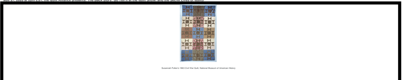
May 27, 2020 at 2pm EST, the Quilt Alliance presents: The Back Story: Go Tell It at the Quilt Show! and the Secret Lives of Quilts

June 3, 2020: Surface Design Association